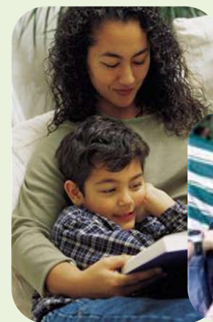
We provide services in English and Spanish.